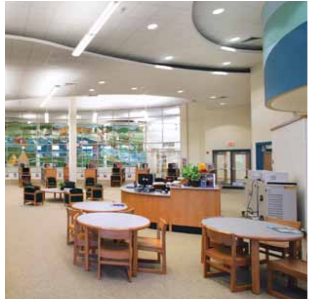
River Crest Elementary School in Hudson, Wis., completed in 2008, achieved gold certification from the U.S. Green Building Council.

Agua Fria staff decided to extend the green cleaning program in place at two schools to the entire district. In the coming months, new energy meters will be installed so staff can benchmark the performance of each facility and monitor improvements. The team also set a vision statement for the district to "design, construct and operate our schools and facilities in a sustainable manner while creating