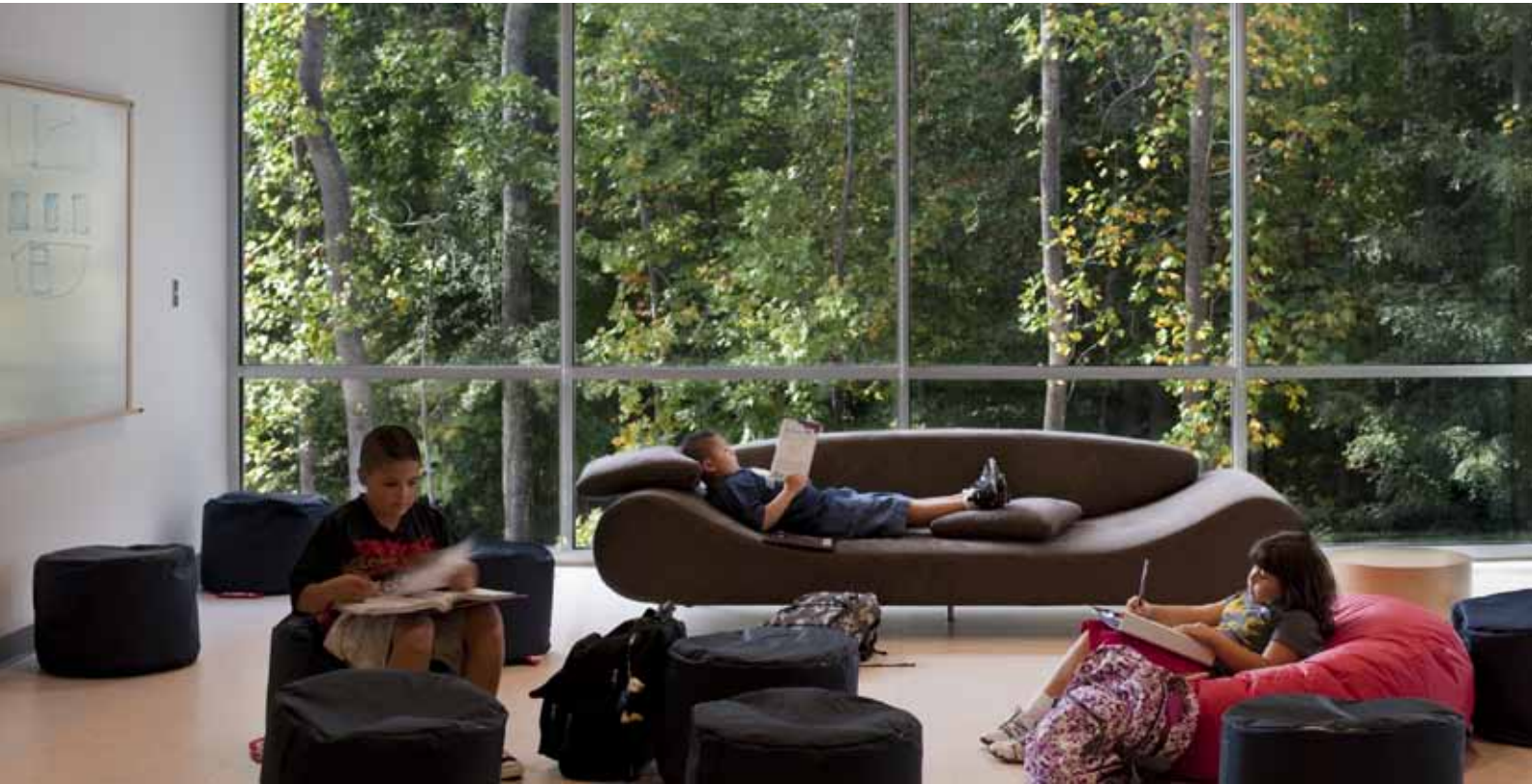
Above: Pupils find comfortable spots to read at Manassas Park Elementary School in Manassas Park, Va., recently selected by the American Institute of Architects as one of 10 examples nationwide of sustainable architecture and green design solutions. Right: An exterior look of the school, whose architects integrated an environmental curriculum into design elements.

comprehensive sustainability program or initiative. How will you convey the benefits of green schools to other administrators, parents, teachers and taxpayers? The key to successful engagement is identifying and communicating the advantages that resonate most with each audience.